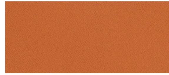
RB25 • mango