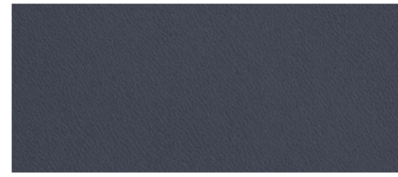
RB12 • navy blue