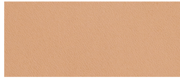
RB30 • natural