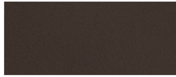
RB09 • moka