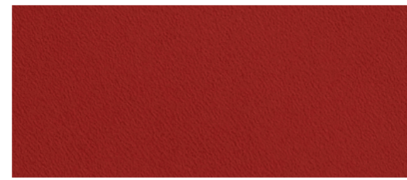
RB23 • red