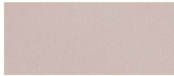
RB17 • cream

Waterproof. Tanned in Italy. Origin: France.