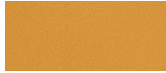
RB36 • yellow