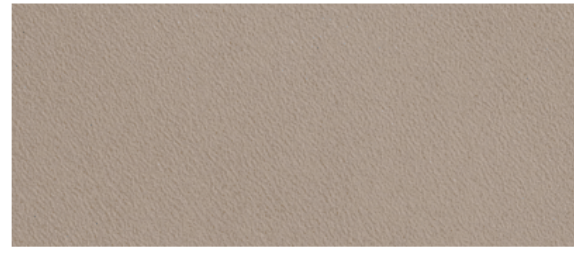
RB20 • mud