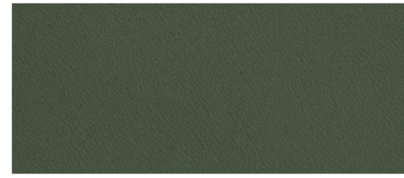
RB14 • loden green