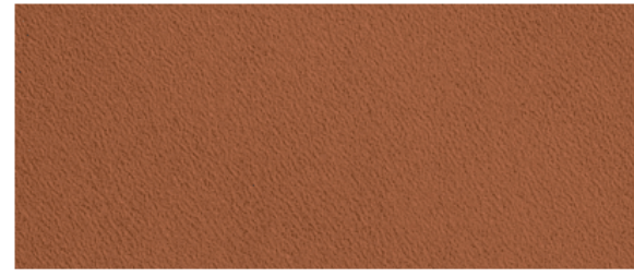
RB24 • cognac