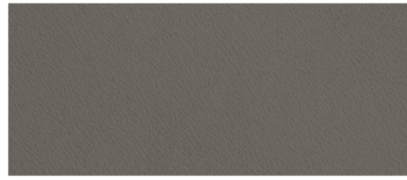
RB19 • graphite